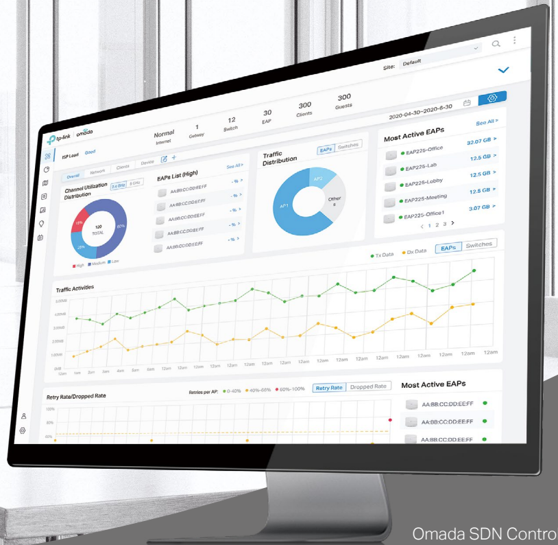
Omada SDN Controller