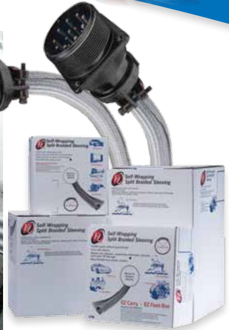
F6 is available in self-dispensing boxes.