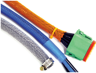
When cut with a hot knife, the sealed ends of Flexo PET allow for varied termination solutions.