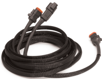
Flexo PET installs quickly in production harnessing environments, reducing assembly cost.