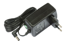
24 V 1.2 A power adapter included

IPsec hardware encryption (~470 Mbps) and The Dude server package are both supported, and the microSD slot provides improved read/write speed for file storage.