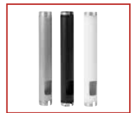
Available in silver, black or white to match displays, projectors and ceiling mount surfaces