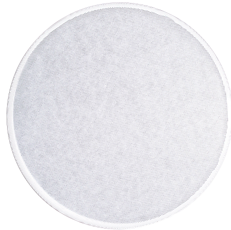
E-675TL-X 10 watt

High power handling 6.5" in-ceiling speaker system New magnetic trimless grille Smooth-wide frequency response 6.5 inch polypropylene woofer cone Rubber woofer surround 20 oz ferrite woofer magnet 1 inch aim-able silk dome tweeter Neodymium tweeter magnet High quality crossover with air core inductor Pure white acoustically lined magnetic grille 4 heavy duty mounting clamps. Gold plated 12awg binding posts Complete rough in bracket included (RI-675) Available in three 25/70V transformer options 10 watt / 20 watt / 30 watt Sold as each Master carton 6 pcs 10 year warranty