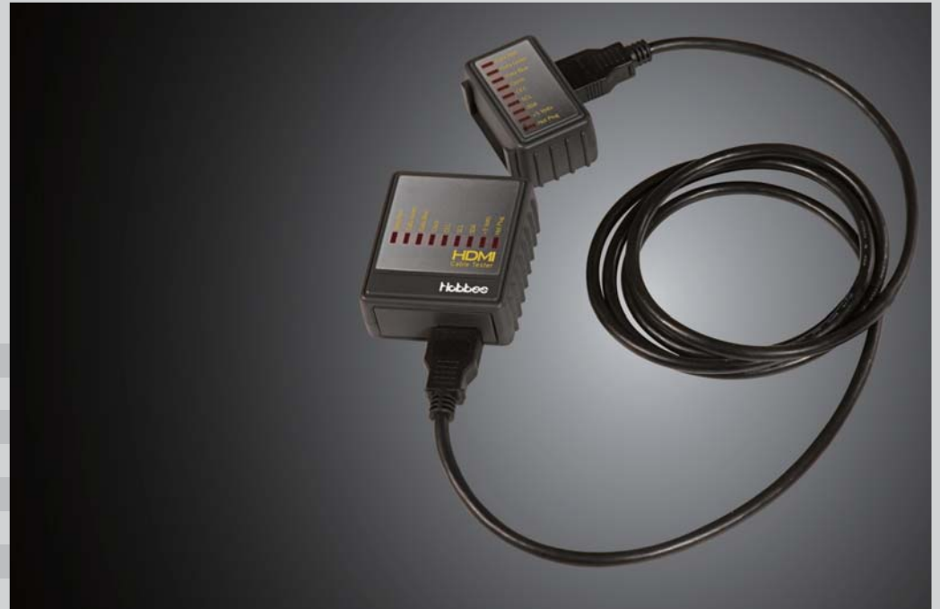
LED Definition (HDMI type A cable pin-out)